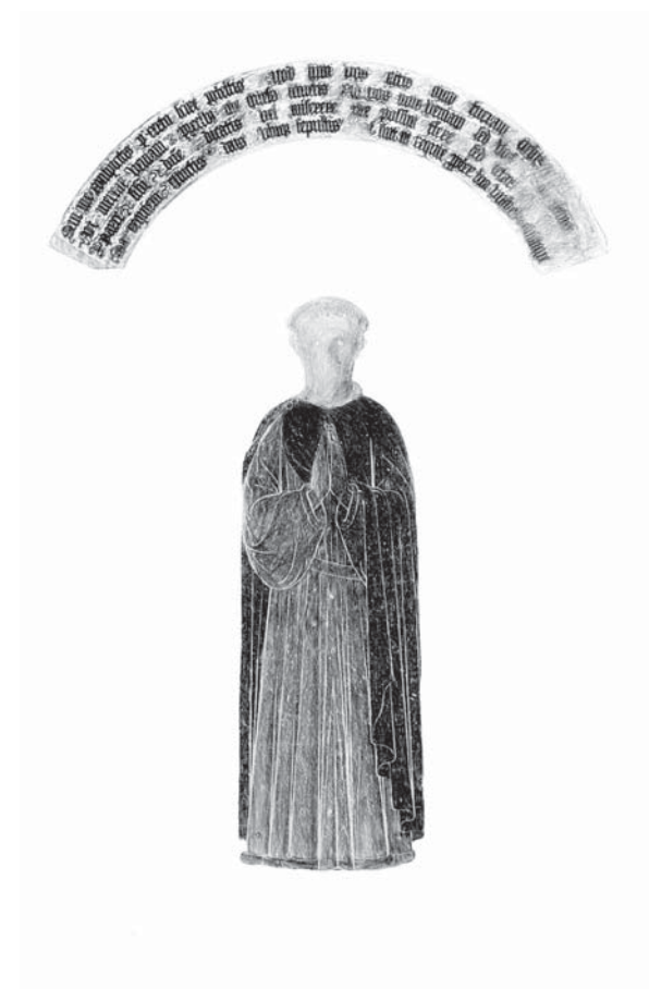
effigy: 87,5 x 28 cm